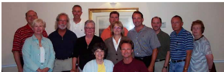
2006 Board Members